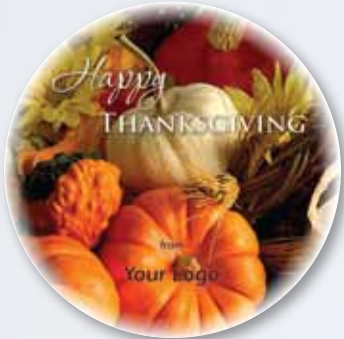
T3 Thanksgiving 3