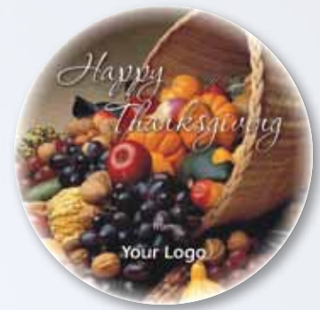
T2 Thanksgiving 2