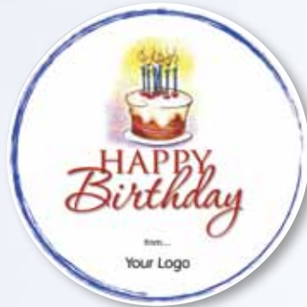
B1 Birthday Cake