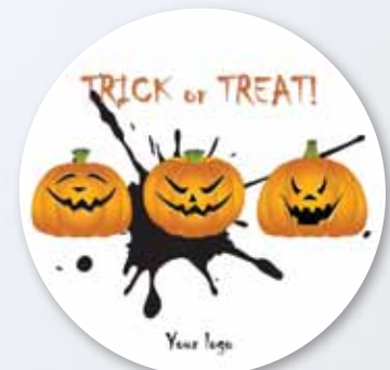
H2 Trick or Treat