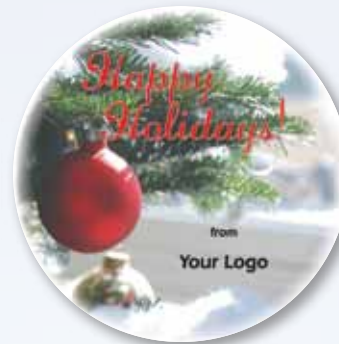
C1 Red Ornament