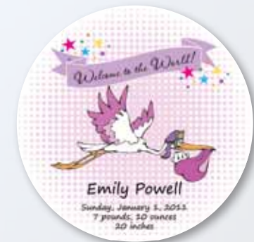
BB2 Pink Tin