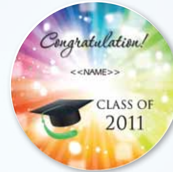
G2 Graduation 2