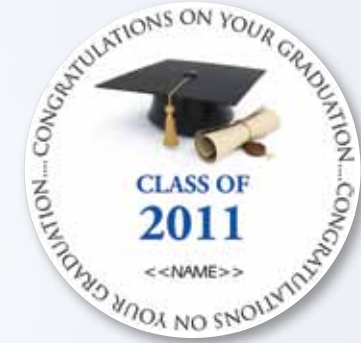
G3 Graduation 3