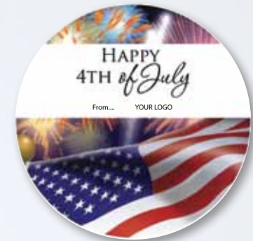
I2 4th of July 2