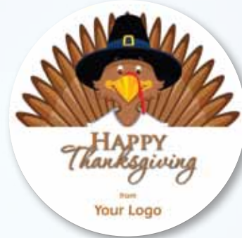
T5 Thanksgiving 5