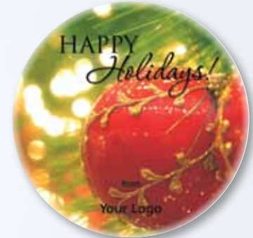
C6 Red Gold Ornament