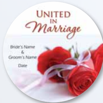
W1 Red Roses