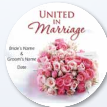
W2 Pink Roses