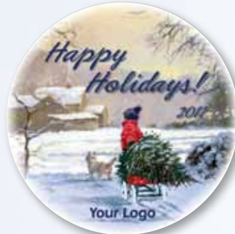
C4 Red Sweater Boy