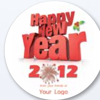
C9 Happy New Year 1