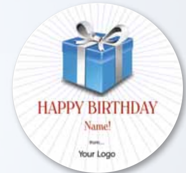
B3 Birthday Gift