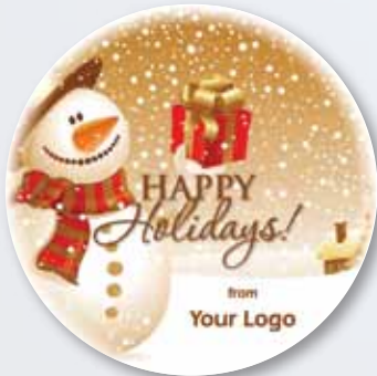
C7 Snowman with a Gift