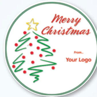
C5 Christmas Tree