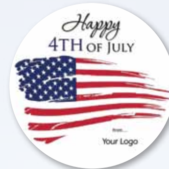
I1 4th of July 1