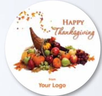
T6 Thanksgiving 6