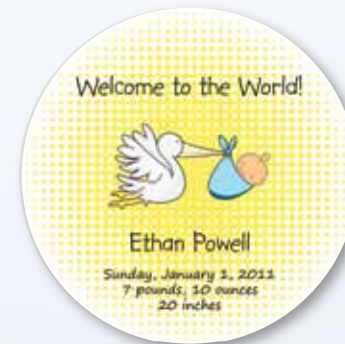
BB1 Yellow Tin