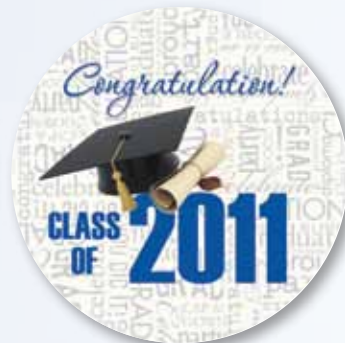
G1 Graduation 1