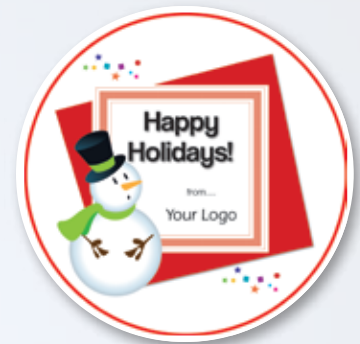
C2 Santa with Frame