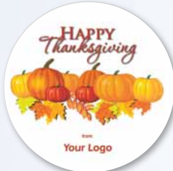
T4 Thanksgiving 4