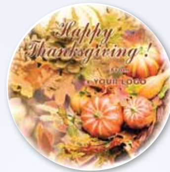
T1 Thanksgiving 1