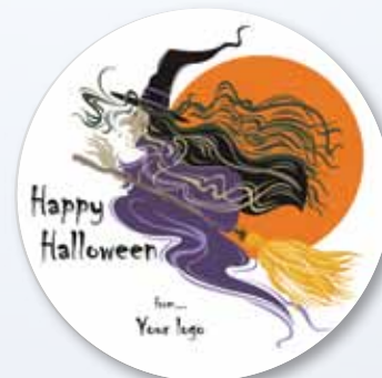
H1 A Witch