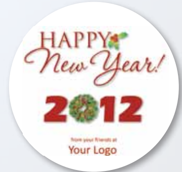
C10 Happy New Year 2